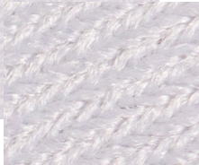
Please request sample for exact color and texture.